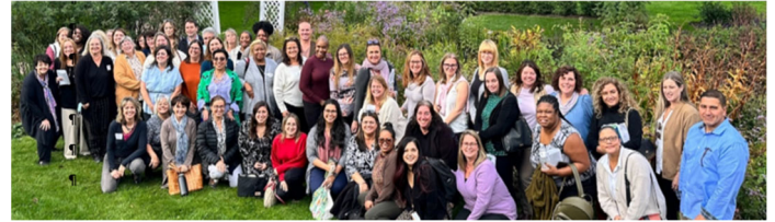
Pictured above is OVS staff at Webb Deans Stevens Museum, Wethersfield on October 17, 2023.