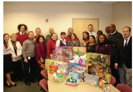
Bridgeport Juvenile Probation staff with donated holiday gifts for local youth