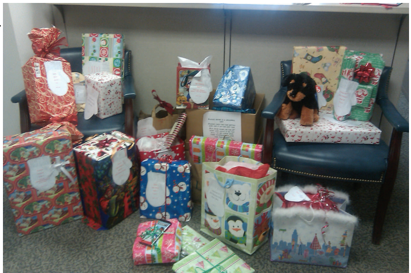
A small portion of the holiday gifts purchased by Central Office staff for the women and children of Fresh Start in Hartford, and Elm City Women's and Children's Center in New Haven.