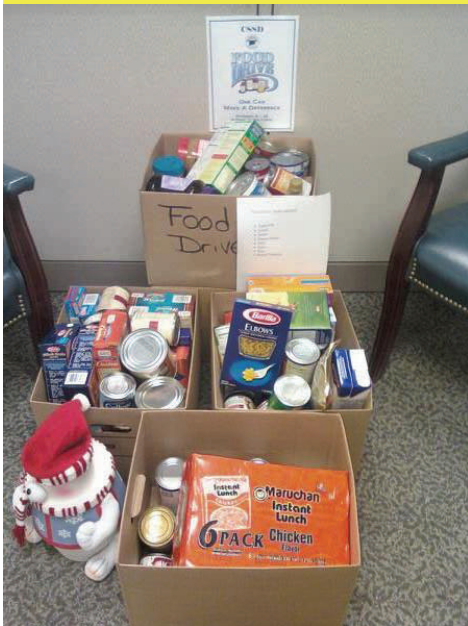
Food drive items collected by Central Office staff for the Wethersfield Food Bank.

also arranged for the office to adopt a family of seven children and a single parent mother, who is deaf. Officers purchased toys for the family, as well as food, to assist the family over the holidays.