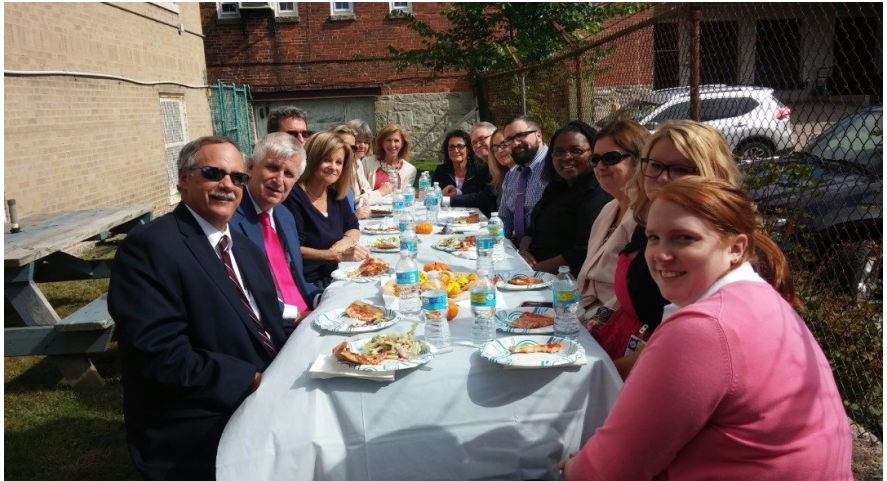
CSSD Litchfield Family Services staff are honored at a luncheon provided by the JD Clerk’s office during Service Excellence Week