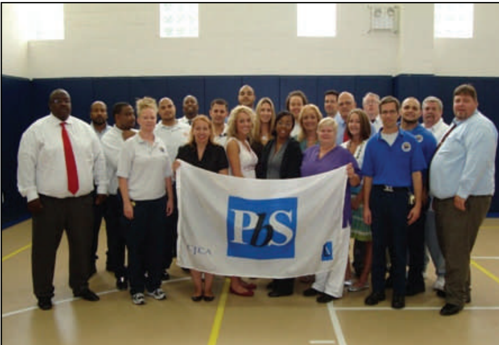
~Congratulations to the New Haven Juvenile Detention staff~

hues. In 2008, a large gymnasium—with tall windows to allow natural light to stream in—two new classrooms, an administrative wing, and other individualized areas were added to the building. This expansion gave detention residents and staff more room to operate and relieved the stressors associated with overcrowding.