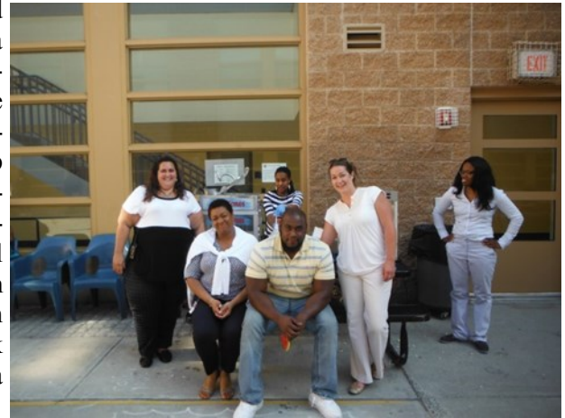
PBIS team members at Hartford Juvenile Detention