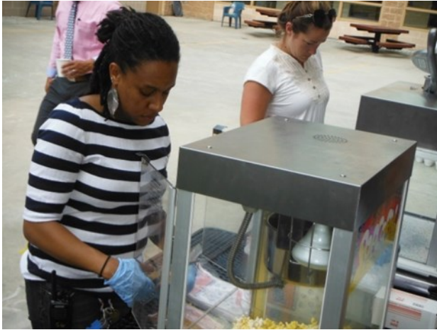
Hartford Juvenile Detention staff man the popcorn machine during the facility's family day in June